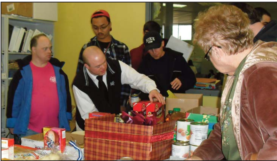
The Aktion Club of FEC/HRW, which is sponsored by the Chester, Middletown and Minisink Kiwanis clubs, collected food for first three weeks of November, then met on Nov. 25 to pack the food baskets and deliver them. They prepared Holiday Boxes for three families for Thanksgiving. They had collected enough to fill additional boxes as well.