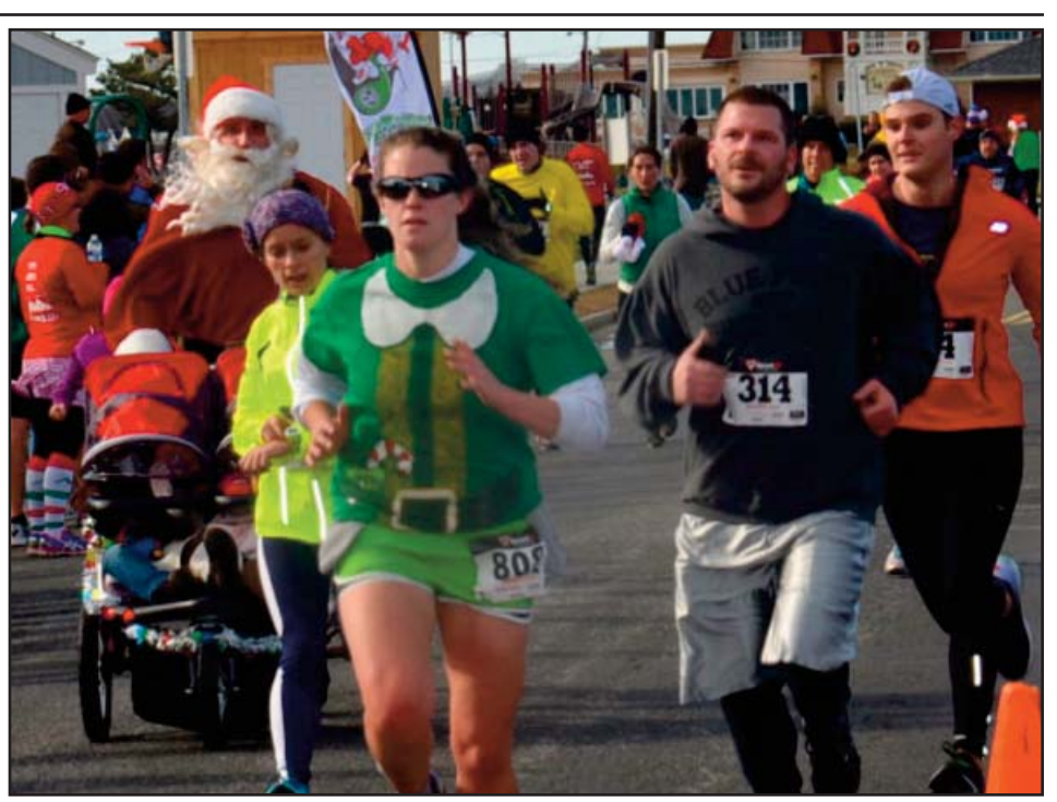
The Patchogue Toy Trot features many runners in seasonal costumes.

views with former students. It also includes a transcript of school board minutes for School District #5 from 1824 thru 1905 along with a description of contemporary historic events (such as the anti-rent wars) to provide context. Copies of the book can be purchased online from Lulu.com; proceeds go to Friends of Thacher State Park.