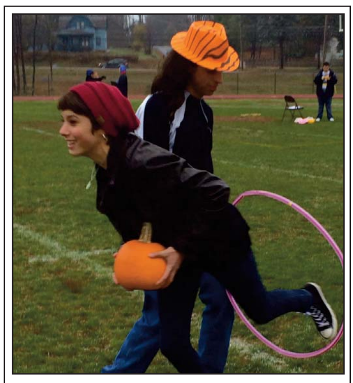
On Nov. 6 the Monticello High School Key Club members put together a fundraiser called the Pumpkin Palooza. Activites included Pumpkin Bowling, Pumpkin Hoola Relay Races, Pumpkin Discus Throwing, Pumpkin shotput and Pumpkin Pair Relays. Monticello Kiwanians and RJK Middle School Builders Club members came out to support the event. The $162 in proceeds will go to the Eliminate Project.

SAVE-A-BABY-A-DAY: Members can pledge to donate $1.80 per day over a one- or two-year period. Payments can be scheduled monthly, quarterly, semi-annually or annually, and taken directly from a credit card if desired. Or, as one woman who was excited about this idea said: "I'd like to put $1.80 aside each morning and then all day I will be aware that I did