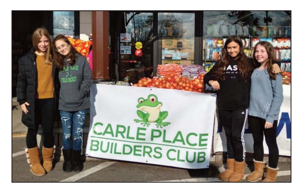
The Carle Place Builders Club collected food for the pantry at Our Lady of Hope Church in Carle Place, Long Island. This club is sponsored by the Kiwanis Club of County Seat, Mineola.