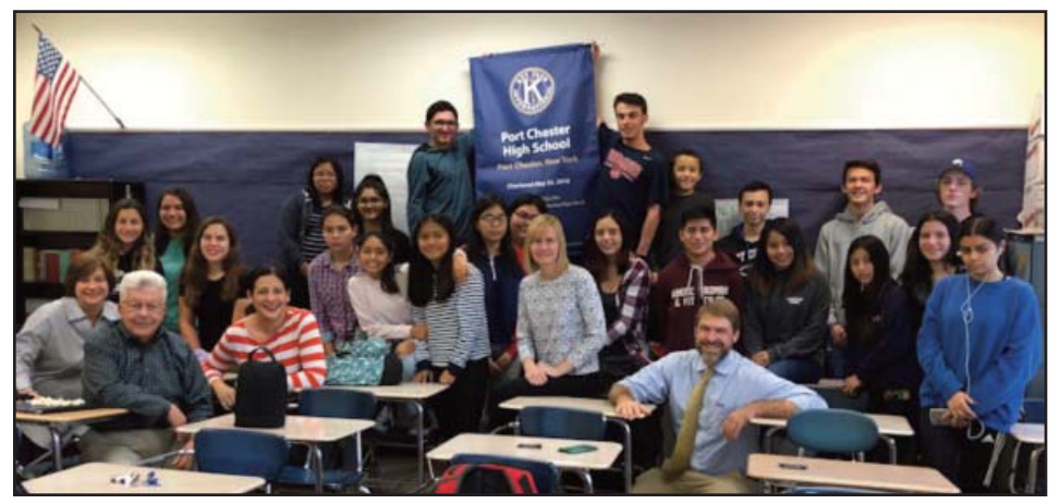
The Kiwanis Club of Port Chester-Rye Brook presented the Key Club banner to the Port Chester High School Key Club on Nov. 7. The new club has jumped right into community service by working at Crawford Park, a town-owned park that needed trees freed from invasive vines.