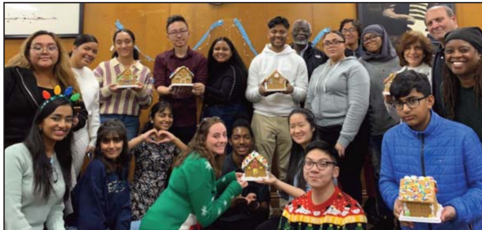
School in the South Bronx as needing a few age-appropriate toys to make the holidays more cheerful for these children. these items, along with club donations of

More than $1,000 for POTS (Part of the Solution) was raised for groceries in a shop setting to help those below the poverty line to become self sufficient. The clubs also initiated their annual "Adopt-a-Family" Christmas project in the South Bronx to purchase new coats, shoes, and boots for two children. The family was identified by St. Anselm's Parochial