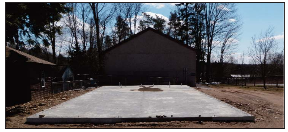
The concrete slab is ready for the new Arts & Crafts Building at Kamp Kiwanis. The old building is at left; in the background is the Morgenroth Drama Center.

Kiwanians also are welcome to attend the awards night, every Friday evening from 7 to 8:30 p.m., when deserving Kampers receive awards for their week