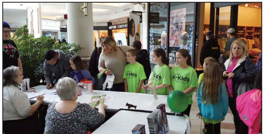
Above, Builder's Club members check in before collecting donations. Below, Kiwanians at the booth in Eastview Mall.