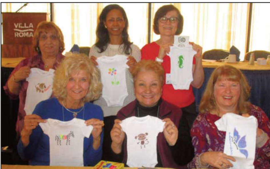
On Saturday morning a group of first ladies spent some time decorating "onesies" as part of the Warm Beginnings project. Others also joined in the project.