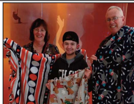
Empire State Kiwanian Page 11