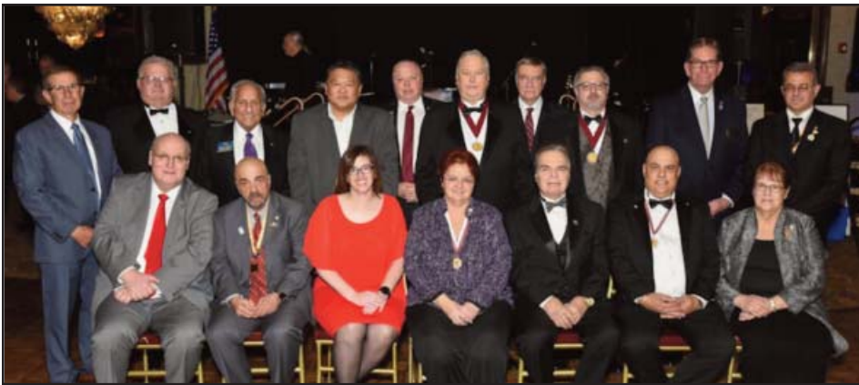
Foundation Board Members posed for a picture at the dinner.