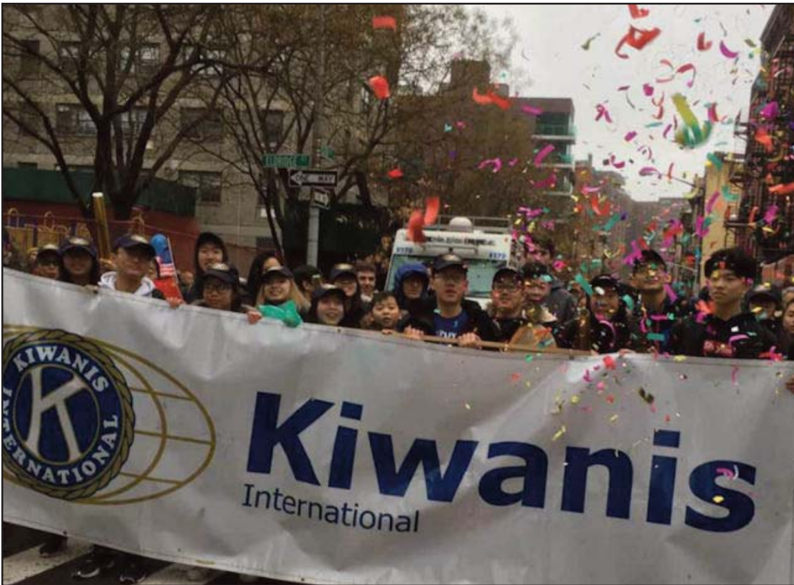
Members of the Chinatown club and other Kiwanians participated in the Chinese New York Parade Feb. 25 in New York City.