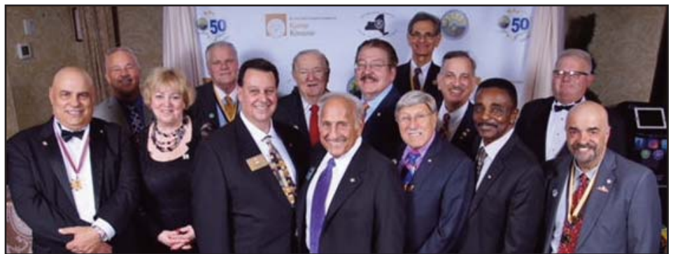
The past governors present for the event.