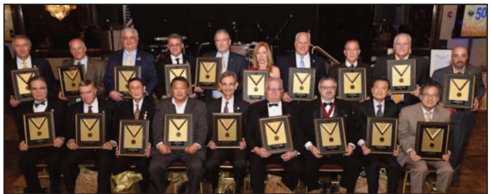
Special 50th anniversary medallions were presented to kamp supporters.

The kamp, which opened to kampers in 1971, has begun serving girls along with boys, disable adults and children with special needs while expanding to accommodate more kampers and to increase the opportunities the kamp provides.