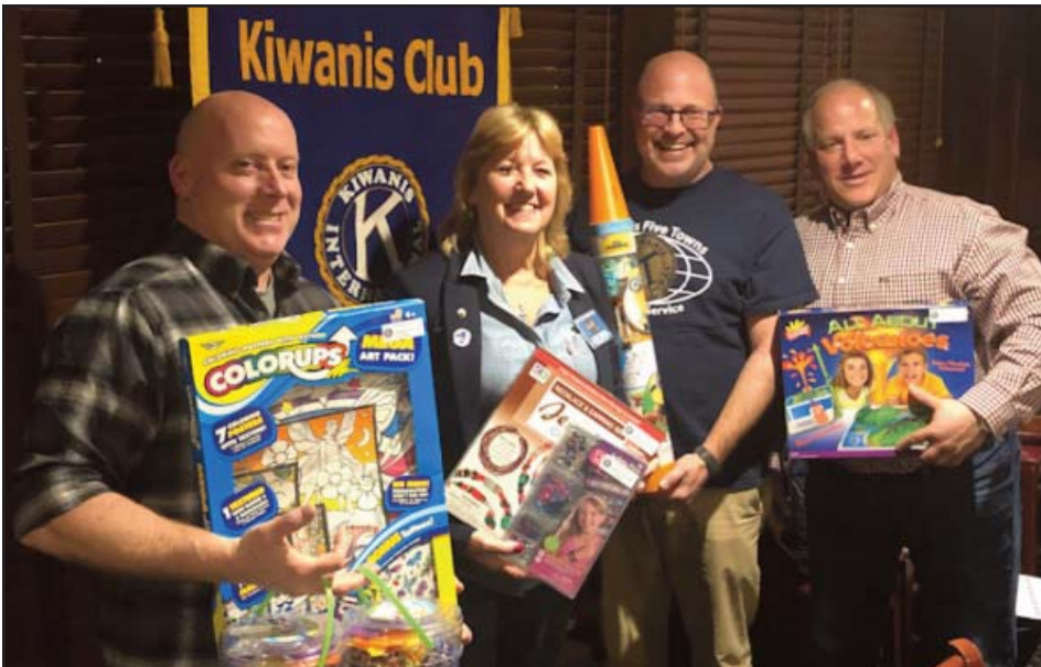
In February the Five Towns club collected Krafts for Kamp items as part of the First Lady's Project.