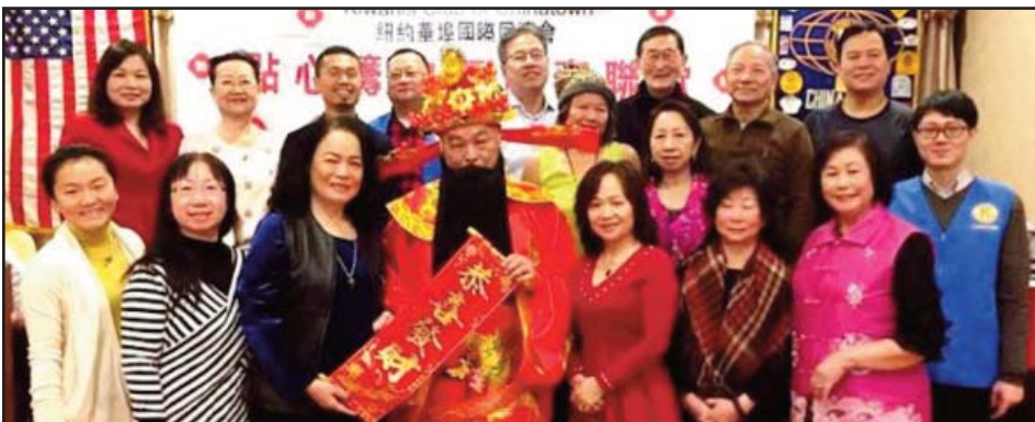
Chinatown Kiwanis Club Dim Sum Fund Raising for Division Baby Shower Project and Pre Chinese New Year Celebration, over 40 members and friends joined with almost a thousand dollars raised.

For more information, see the district web site.