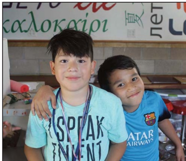
Kamp Kiwanis 2018