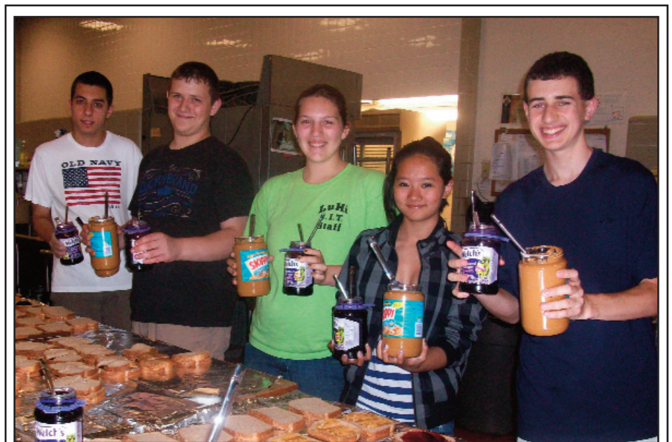
To end the school year it is a tradition for the North Shore Key Club to assist with a very special bike ride: the Nassau to Suffolk Bike Challenge fund raiser for the Kiwanis Pediatric Trauma Center (KPTC). The event is organized by the North Shore Kiwanis Club, the Kiwanis Club sponsors for the North Shore Key Club.