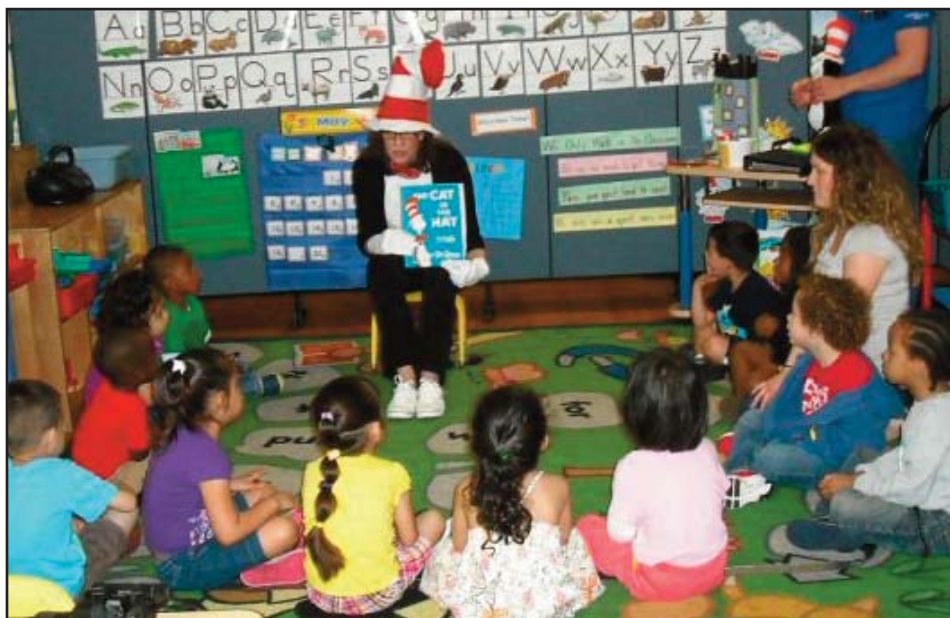
A Middletown Kiwanian reading at a local Head Start school.

Together we look forward to the next 60 years!