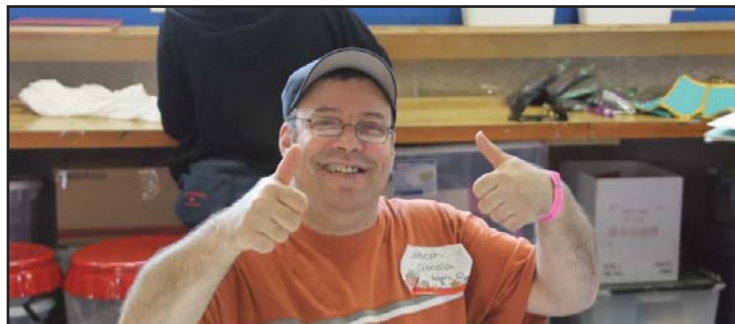
The pictures show the new Kamp Library in use and other activities at the Kamp.