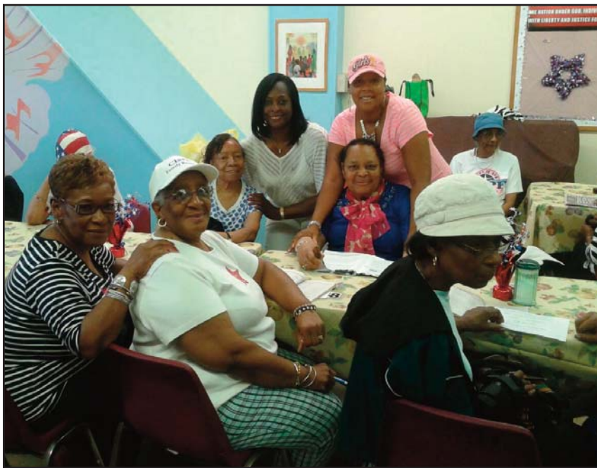
Members of the East Elmhurst/Lefrak Golden K club met on July 4 for some activities.

The organizational meeting for the Kiwanis Club of East Elmhurst/Lefrak Golden K took place on Monday, May 24.