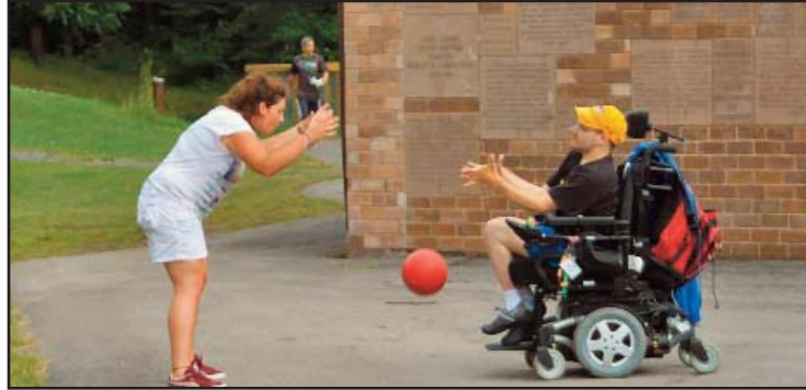
Adult Week started the 2013 season at Kamp Kiwanis.