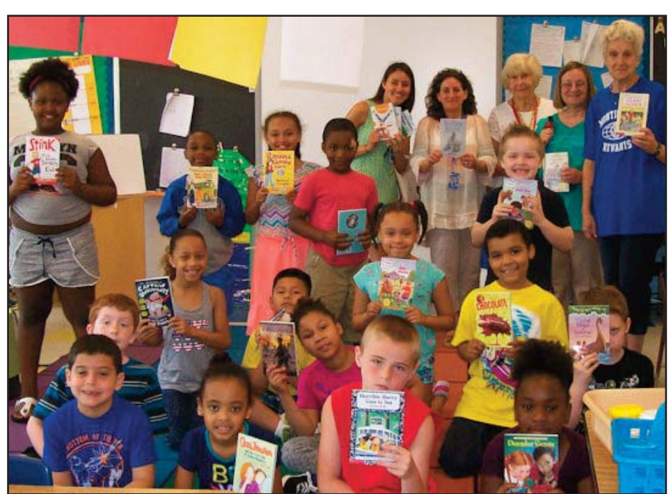
One of the second grade classes showing off their new books.

One class plans to invite kindergarten students to visit their classroom so that they can read their books to them.