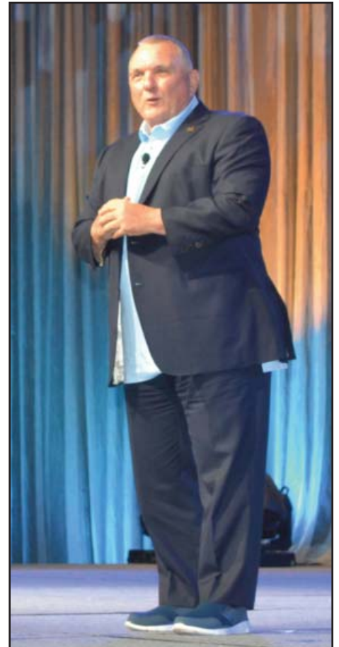
The Keynote Speaker was Rudy Ruetiger, whose career as a Notre Dame University football player was told in the movie "Rudy".