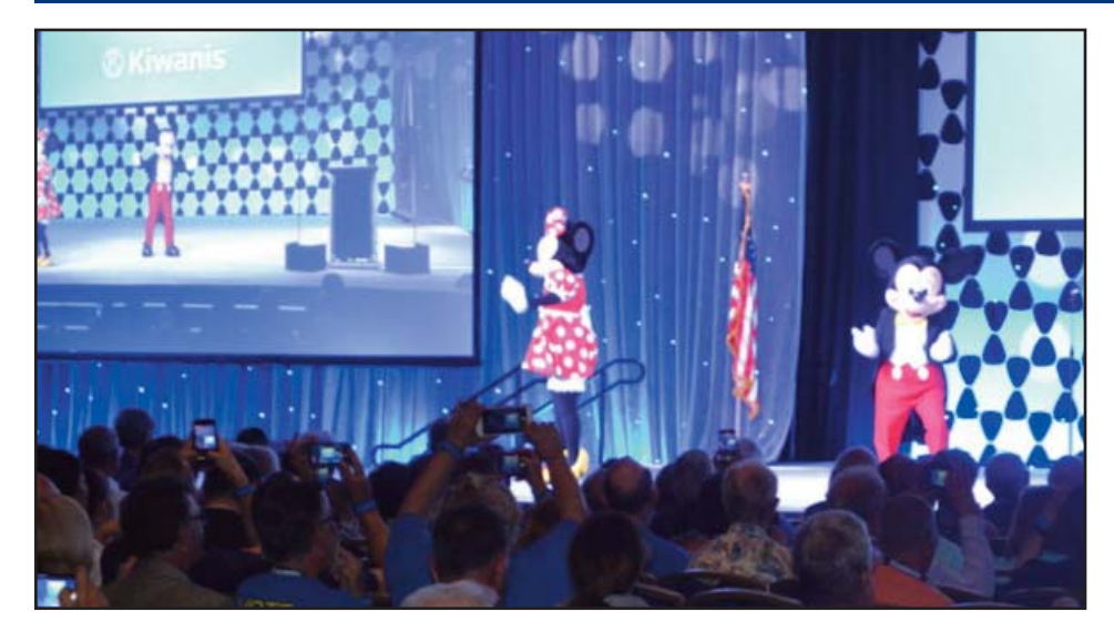
Minnie and Mickey Mouse welcoming the delegates at the Opening Session.