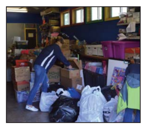
Craft supplies for Kamp donated as part of the First Lady's Project being sorted.