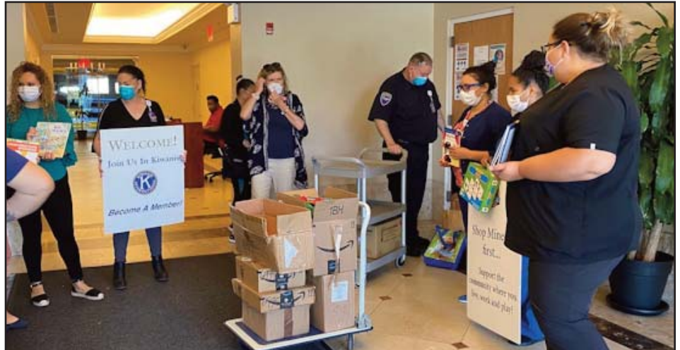
Westbury Kiwanis Club collected books for two weeks and donated them to the Pediatric Center at NYU Winthrop Hospital in Mineola on June 12. The collection continues to run.

and Hampton Art Camp and Outreach for food for families in need; and $250 to the Hampton Bays High School yearbook.