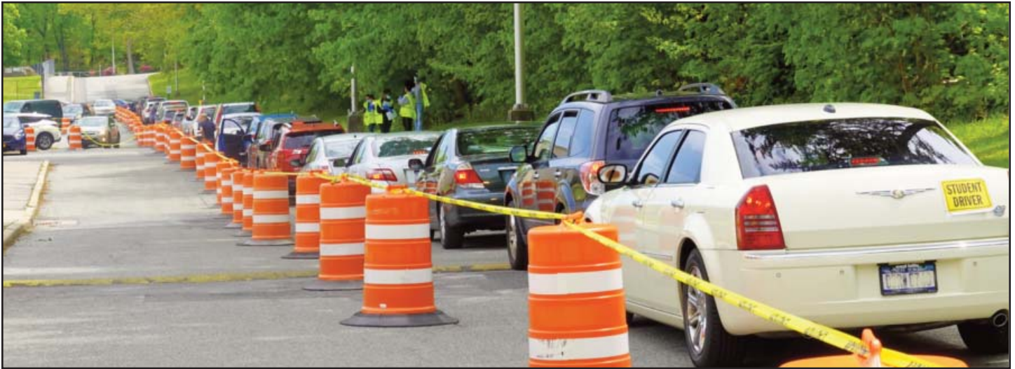
Cars line up for the food pantry in Glen Cove in Mid-May. The effort was supported by the Glen Cove and North Shore clubs.

been difficult to imagine the depth and breadth of the need for daily food support across different economic strata in Glen Cove and nationwide" noted Hill. "COVID-19 and its economic and employment impact have been a profound negative.