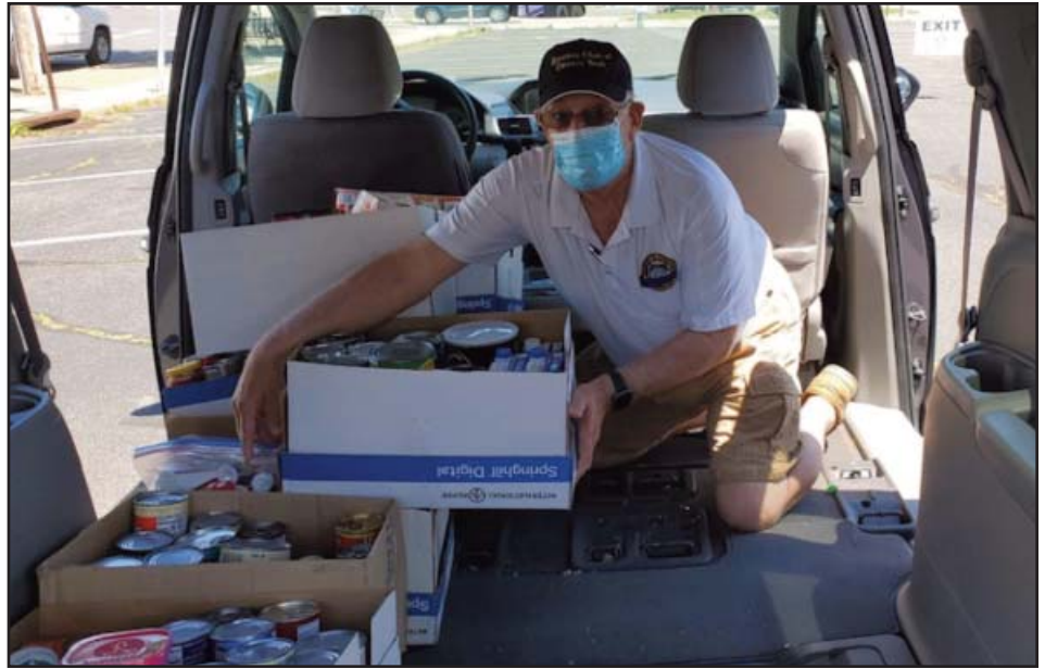
County Seat Kiwanis participated in a joint Mineola/The Willistons' Chamber food collection on May 30. They filled the Salvation Army van twice along with contributions to other local agencies.

During May the club donated $1,560: $300 for Food for Heart of the Hamptons Food pantry; $300 to St Rosalies Church, Hampton Bays, Food Pantry; $60 to Kiwanis Suffolk East Division Project; $150 to Kiwanis Suffolk East Division Key Club support project; $500