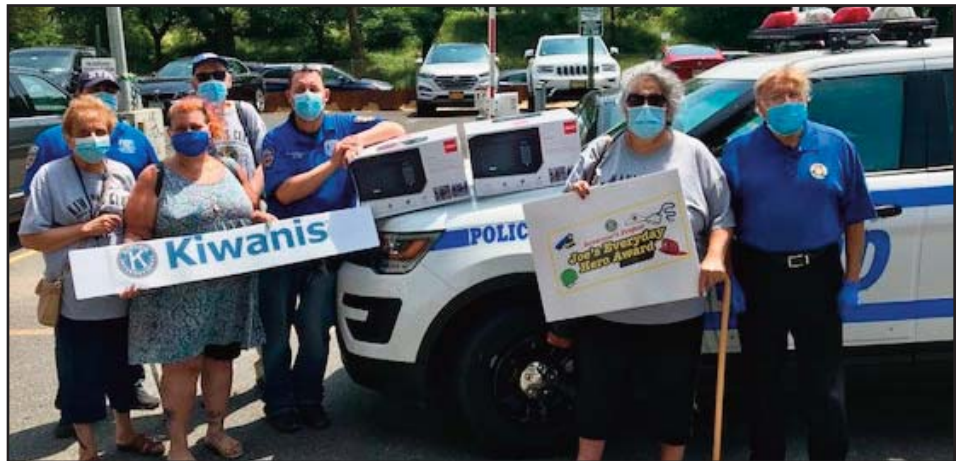
Brooklyn Division clubs delivered microwaves ovens to each department in the Coney Island Hospital. The Brighton Beach Coney Island and Mapleton Clubs also delivered the ovens to the 60th Precinct, PD 34, PSA1 and the Fire House in the Coney Island Community.