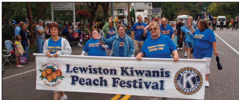
The Niagara County Aktion Club marching in the Peach Festival parade.