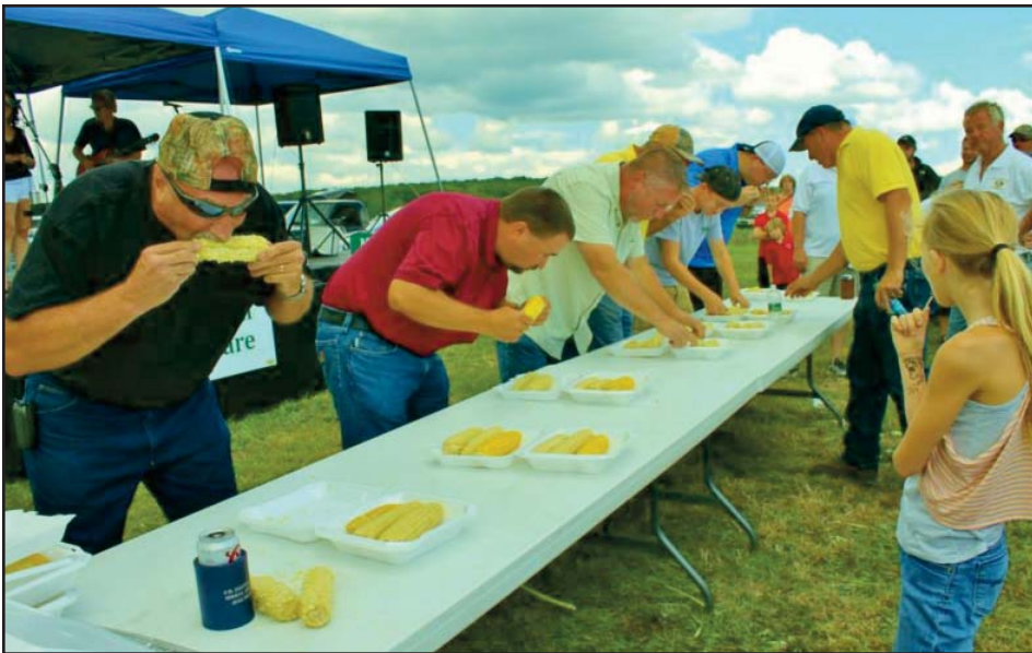
Above, the corn eating contest. Below, the corn shucking contest.