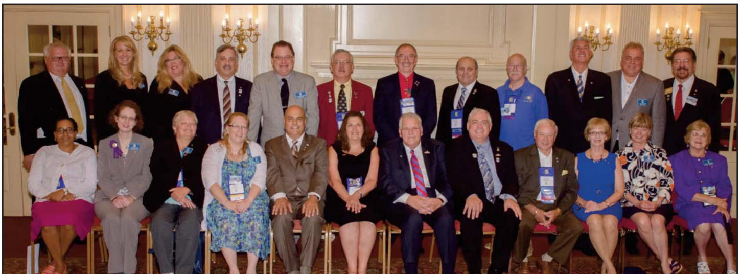
Members of the 2015-16 District Board gathered for a photo at the District Convention in August. the board consists of the district officers and the lieutenant governors.

Kiwanis is simply about you because without you there is no US and then what becomes of that child or that senior, who remembers that veteran or provides that service it's all about KIWANERGY and KIWANERGY is you.