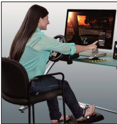
Student using distracted driving simulator.