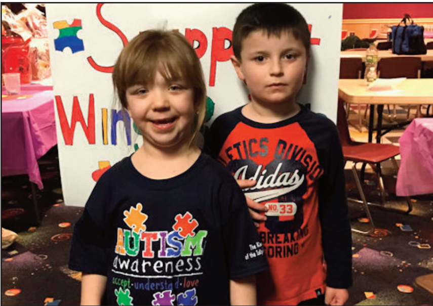
Two participants in the Islip program.