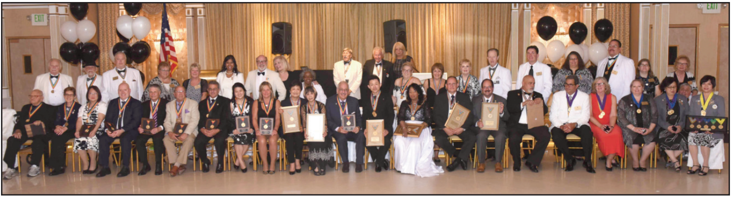
The 2017 KPTC Fellows.