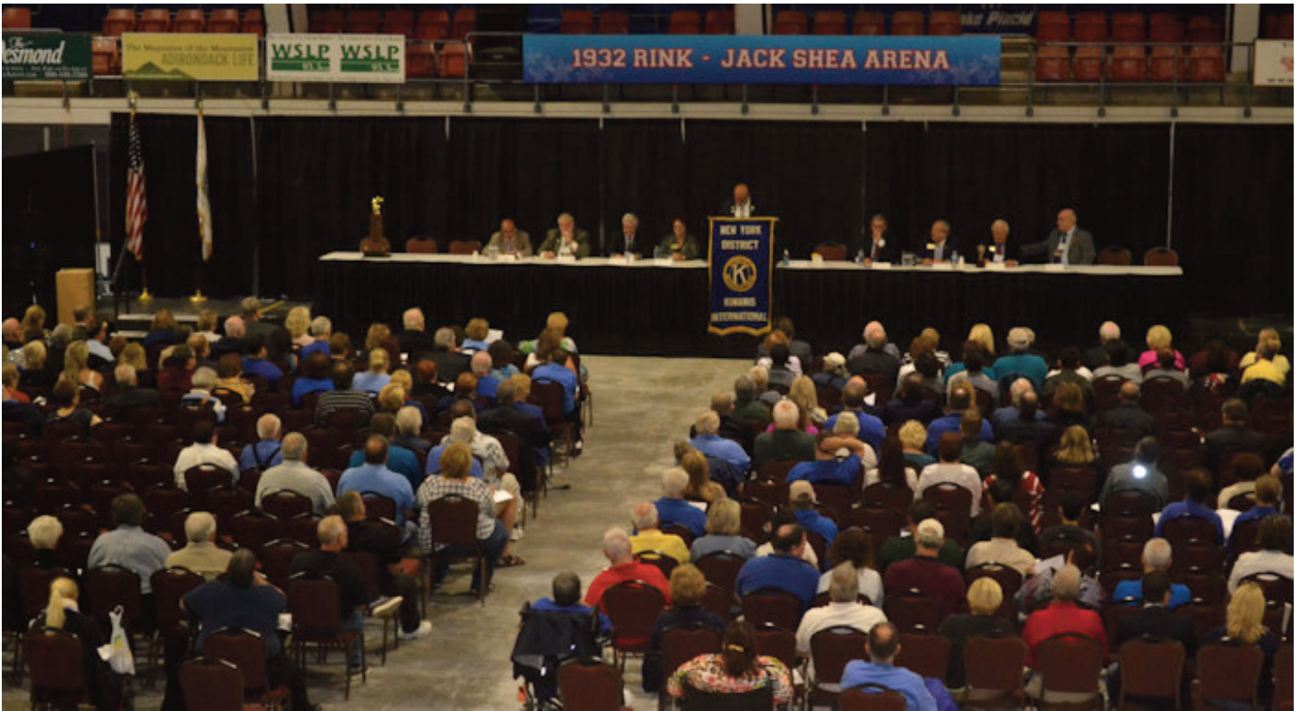
The House of Delegates, taking place in the ice rink used for the 1932 Winter Olympics.