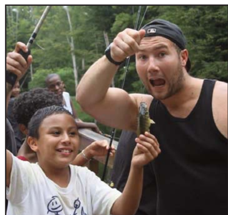
Empire State Kiwanian Page 11